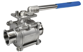
2-1/2" to 4"