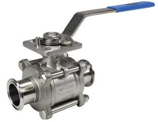
1/2" to 2"