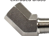
316 stainless steel