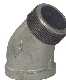
150# galvanized iron